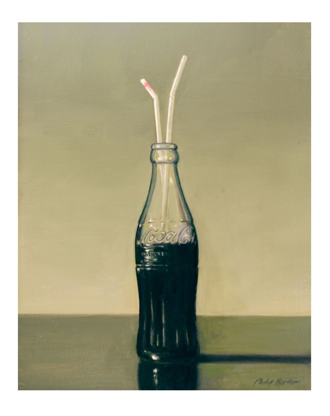
ART IS MY LIFE, AND I WILL ALWAYS KEEP LOOKING FOR ANOTHER ADVENTURE.