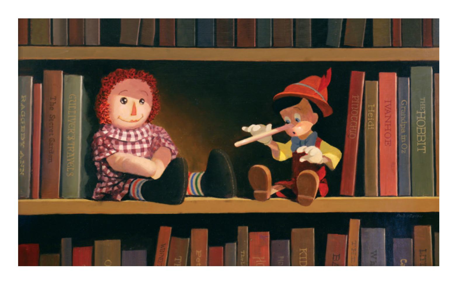
My life since the sixth grade has been ART! It has been an obsession, a challenge, AND AN ADVENTURE OF ALL ADVENTURES.